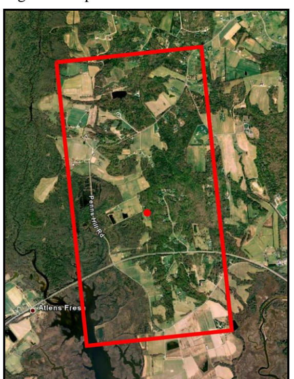
Figure 1. Reconstructed boundaries of Westwood Manor. The red dot shows the location of 18CH621. Scott M. Strickland.

The discovery in the mid-1990s of one of these plantations, followed by a recent analysis of its associated artifact assemblage, has allowed a look into the social aspirations of the gentry in this region. Despite its semi-isolated nature at the end of the 17<sup>th</sup> century, wealthy inhabitants of the