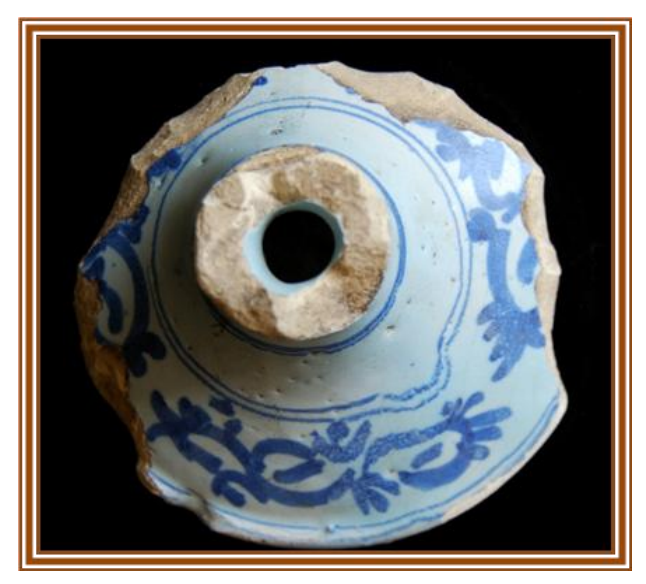
Figure 3. Base of a tin enameled earthenware tulip vase found at Westwood manor.

Visitors to Bayne's home, seated on turkey work chairs and offered punch from painted bowls or wine in delicately molded stemware, surely could not help