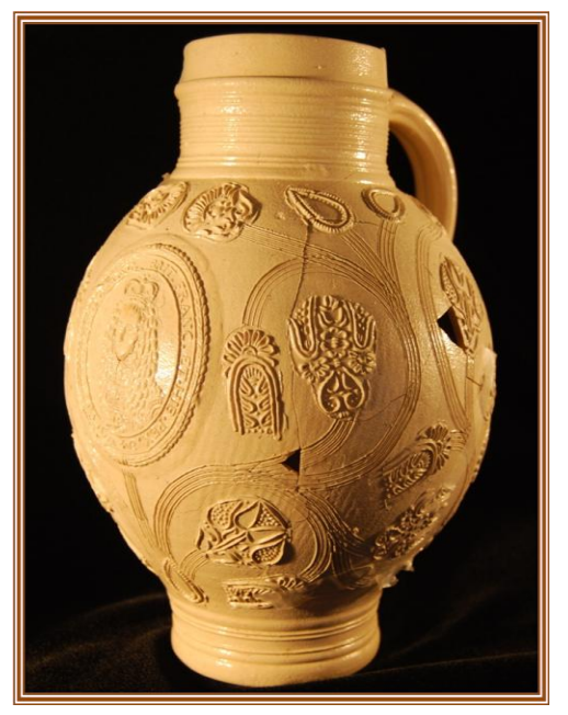
Figure 5. Reconstructed Hohrware jug from Westwood Manor.

but be impressed with the genteel furnishings designed to showcase his education, taste and wealth: a large looking glass, pictures of King William III and Queen Mary in gilt frames, chests of drawers, fashionable cane chairs covered in green fabric, a variety of books, silver tankards, tumblers and spoons, and a pedestal footed vase (Figures 3 and 4) manufactured for displaying tulips whose bulbs, incidentally, had to be imported from Holland. In a world where most planters lived in one or two room house without architectural embellishments, Bayne's home and its contents would have seemed very grand, indeed.