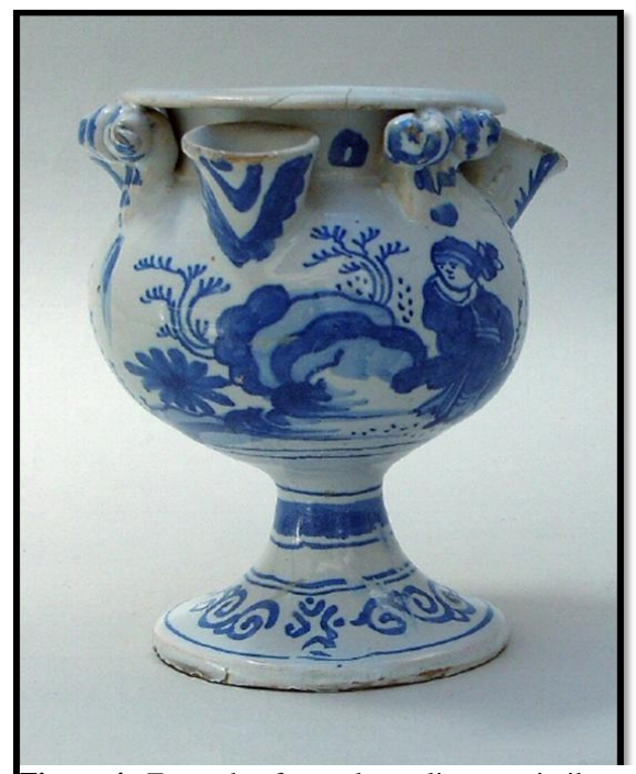
Figure 4. Example of complete tulip vase similar to Westwood Manor example.

Visitors to Bayne's home, seated on turkey work chairs and offered punch from painted bowls or wine in delicately molded stemware, surely could not help