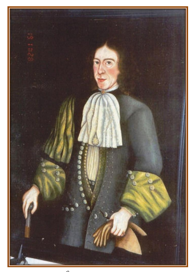
Figure 9. Late 17<sup>th</sup>-century portrait of an unknown American gentleman depicting clothing popular in this period. Artist unknown. Illustration accessed at http://en.allexperts.com/q/U-S-History-672/2010/5/17th-century-art-Massachusetts.htm

While this painting is a compelling visual reference, probate inventories also provide a great resource for comparative data. These courtordered documents "preserve in some measure a record of how Anglo-Americans perceived and valued artifacts.... [helping] lead us to an understanding of the communicative and symbolic value of artifacts" (Beaudry 1978:20). Late 17th- and early 18th-century Maryland probate inventories reveal that walking sticks, while not common, were a part of the repertoire of elite planters' possessions. An examination of 106 probate inventories from St. Mary's County, dating to this period revealed that eight individuals owned walking sticks.<sup>3</sup> Three of these individuals owned sticks that were described as having silver heads. Not surprisingly, these men's estates were valued among the wealthiest in the county, and included Governor Lionel Copley, Major Thomas Beale and mariner and planter Paul Simpson.<sup>4</sup> John Notley of nearby St. Clements Manor had a painted walking stick with a pewter head—definitely less elegant and costly than the silver headed sticks, but still considered worthy of a more detailed description than the generic walking sticks of carpenter Daniel Clocker, constable Thomas Bassett or Major John Low.<sup>5</sup>